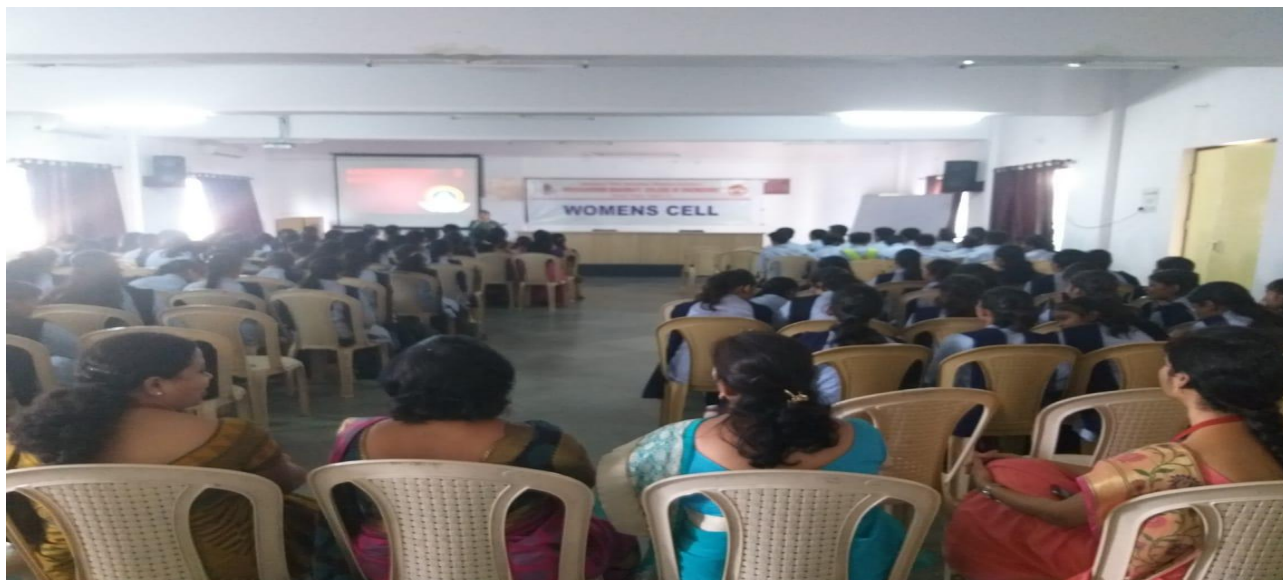
Seminar on Women Empowerment