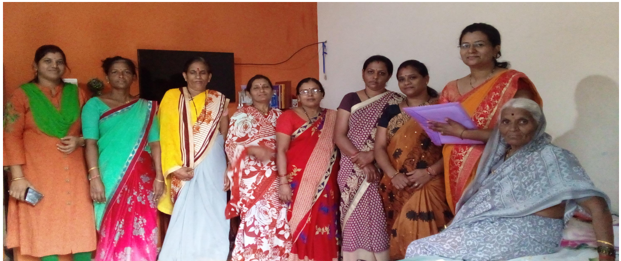
Yoga & Meditation