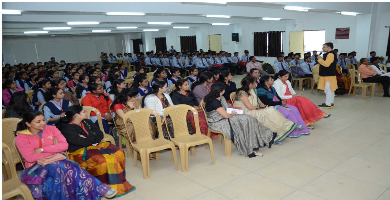
Guest Lecture on Happy Parenting