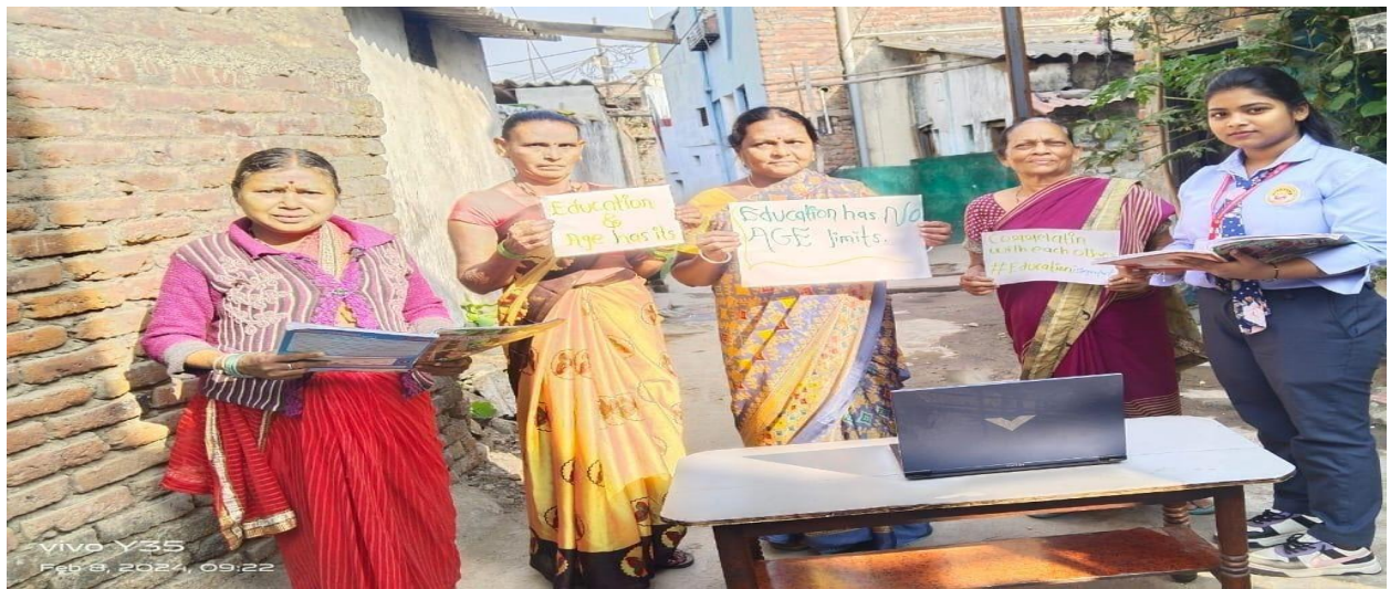
Financial Inclusion Awareness Drive for Rural Women